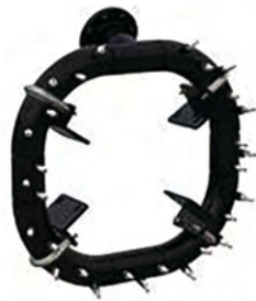
WATER JETTING RING

Enhance your pumping and dredging abilities with our premium add-ons. Our specialized equipment is designed to optimize your project by increasing solids production of your pump. Attachable add-ons are easy to install as the need arises. Contact us today to learn about the best add-ons available for your project.